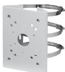
PFA150 Pole mount